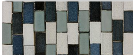
Neptune's Blue and Sharkskin