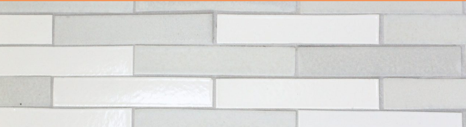
Pictured above: Shark's Milk in a Brick Bond pattern.

Elementals, the Trikeen mosaic collection, offers a creative blend of sizes and colours crafted from our Basics series. Elementals are sold in meshed sheets by the square foot. A variety of patterns and color blends are available for customization. Designers may select from our standard collection of random blends (listed next) or create their own unique combination of up to three of our Basics colors.