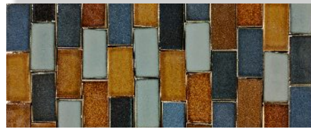
Goldspot and Neptune's Blue