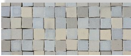
Crackle White and Sharkskin