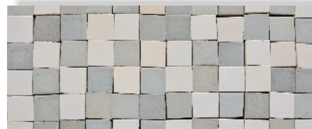
Milk White and Sharkskin