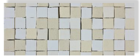
Milk White and Crackle White